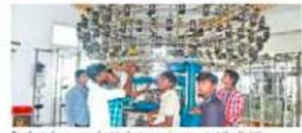
Students have a peek at industry environment at the Knitting Laboratory of NIFT-TEA in Tiruppur.